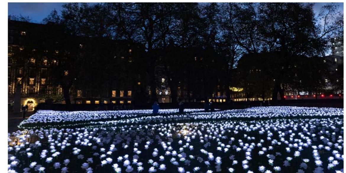
Royal Marsden Cancer Charity, Ever After Garden

Closer to home, the Rothschild Foundation provided a Financial Assistance Fund offering grants of up to £500 to staff facing unexpected or unaffordable costs. Since launching in April 2023, forty-eight applications have been approved and £25k of funds have been allocated.