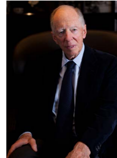
Lord Rothschild

It was with great sadness that the Rothschild Foundation announced the passing of its Patron and Chair Lord (Jacob) Rothschild OM, GBE, CVO, at the end of February 2024.