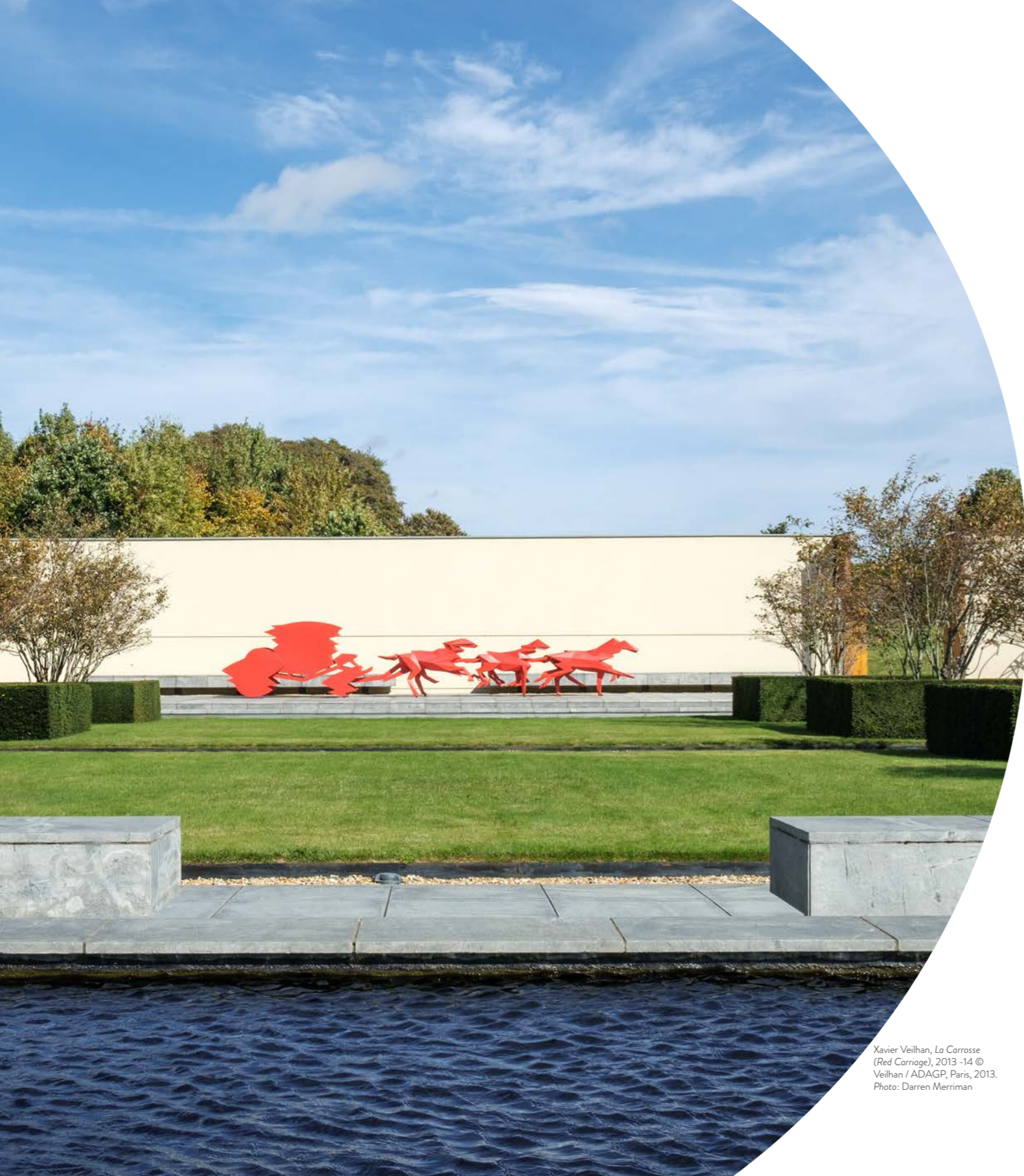
Xavier Veilhan, La Carrosse ( Red Carriage ), 2013 -14 © Veilhan / ADAGP, Paris, 2013.