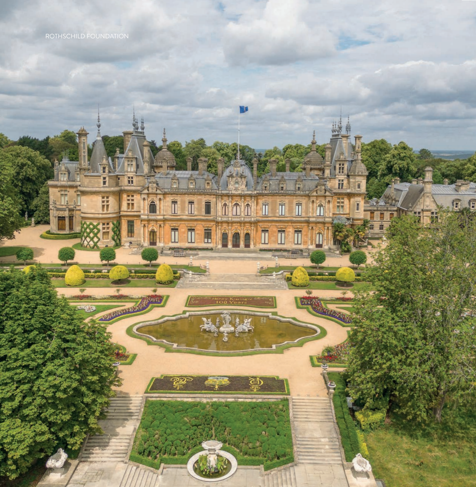
South front of Waddesdon Manor.