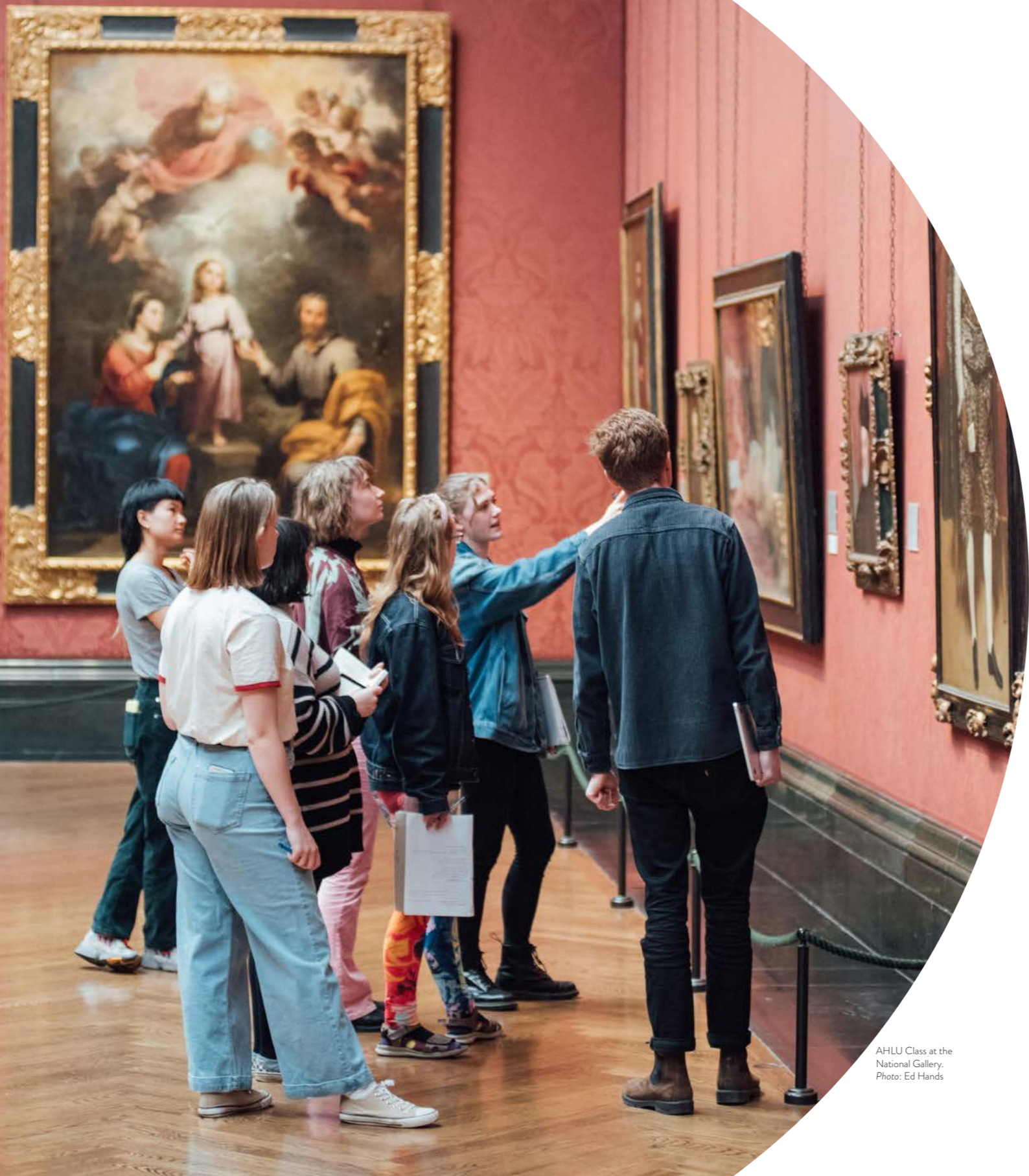
AHLU Class at the National Gallery.

Culture, heritage and the arts are cornerstones of the Rothschild Foundation's grants programme. Our funding includes support to renowned cultural institutions as well as grass-roots projects that have a direct impact on creativity in communities. We are committed to investing in a cultural sector that is secure and stable, able to innovate and experiment, and most importantly, is accessible to all.