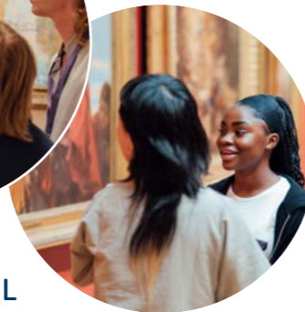
LINK-UP AHLU class at the Courtauld Institute.