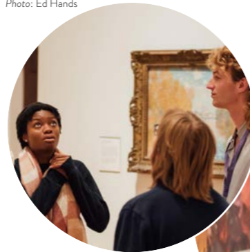
ART HISTORY Introduction course at Dulwich Picture Gallery.