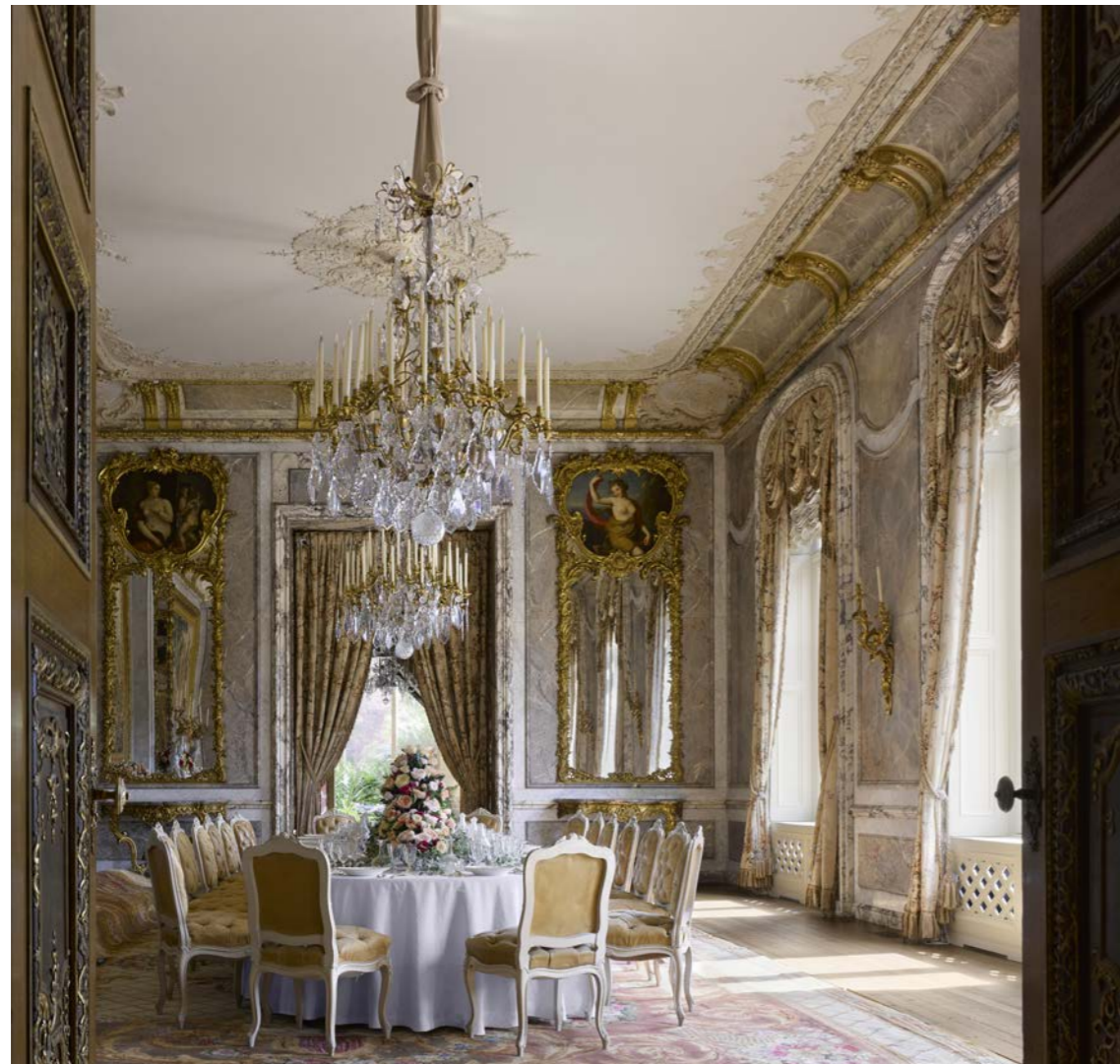
Dining Room, Waddesdon Manor.

As well as funding, we look for ways for the Foundation’s wider assets to support our charitable objectives. Waddesdon Manor is the golden thread that connects all our work, inspiring our funding priorities and allowing us to deliver our charitable objectives ‘on home soil’.