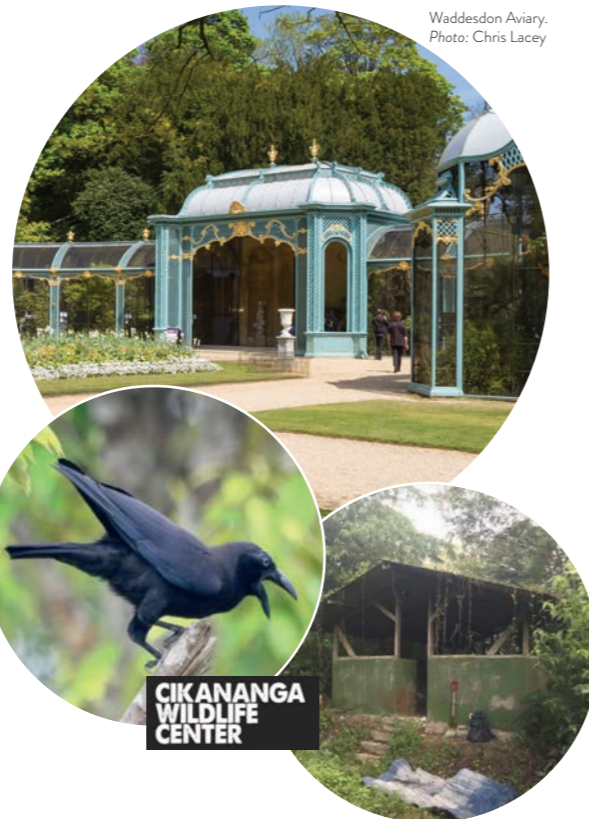
Waddesdon Aviary.

Waddesdon Manor continues to provide a home within the beautifully restored Aviary to many colourful and exotic birds with one third of the species being at risk of extinction. Waddesdon participates in captive breeding programmes with the aim of reintroducing birds into their native habitat. The Aviary maintains the status as a zoo by providing grants to partner conservation organisations. This year, £10,000 was granted to Cikananga Wildlife Center in Indonesia to support the preservation of endangered and critically endangered Songbirds. A grant of £4,600 was also made to The Universitas Indonesia to support their research and conservation campaign of the critically endangered Banggai Crow.